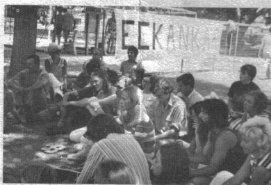
Orange County Satsang Society sponsored the 2nd Annual ECK-IN-THE-PARK picnic July 18th in Anaheim, Calif. Some 200 Southern California ECKists attended. Picture shows part of a group of nearly 100 who sat in a circle chanting, discussing and giving the Love-Tap.